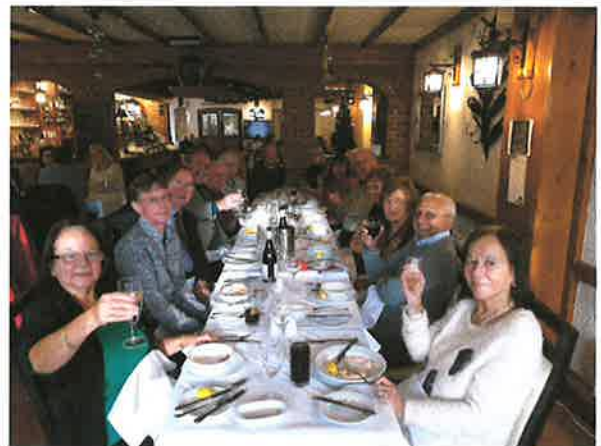
Sixteen happy diners enjoying the group's Christmas lunch at the Sorrento Restaurant in Tolworth on 13 th December. We think they all made it home without mishap, and the restaurant has courageously invited us back next year!

If you have an existing bank transfer or standing order, please update the amount to reflect the change in subscription fee.