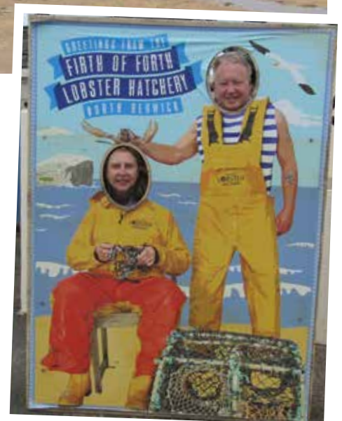
Two group members pose for a photo

An enjoyable day was had by all after such a long time without being able to travel anywhere. A special thanks should go to the coach driver, who negotiated the country lanes and twisty roads expertly!