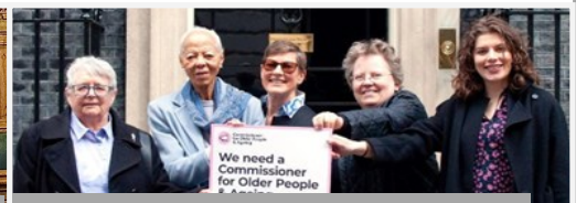
Petition for OP Commissioner to Downing St