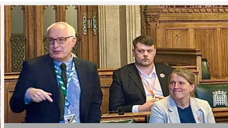
MPs at WFP Parliamentary lobby